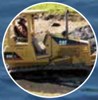
New Lake Design and Construction