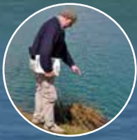
Lake Study Consultation