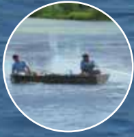
Algae and Aquatic Weed Control