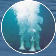
Lake Aeration Installation & Maintenance