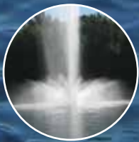
Fountain Installation and Repair